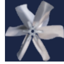
ALUMINUM WITH OUT PATTERN YAF5002-200-AB01 (1270 Type)