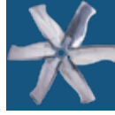
ALUMINUM WITH PATTERN YAF5002-210-AB01 (1270 Type)