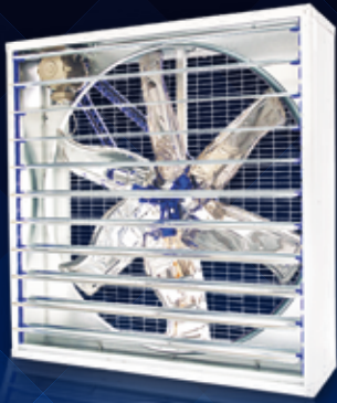
50"/1270 Grill to Shutter and Centrifugal Fan Type