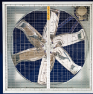
50"/1270 Grill to Grill Fan Type (Slim)