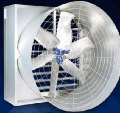
50"/1270 Cone to Mobile Shutter Angle and Centrifugal Fan Type