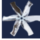
STAINLESS WITH PATTERN YAF5002-310-AB01 (1270 Type)