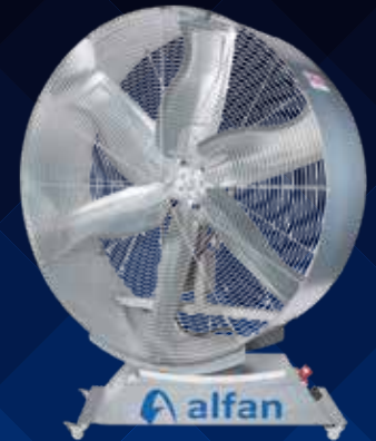
50"/1270 Portable Fan Type